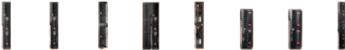
Table of specifications

HP BladeSystem is modular and ready now to take advantage of future technologies in computing, networking, management and storage introduced through 2012 and beyond. By transitioning your existing IT resources to a blade architecture managed by common automation tools, you can reduce effort and time for all operations now and for the future.